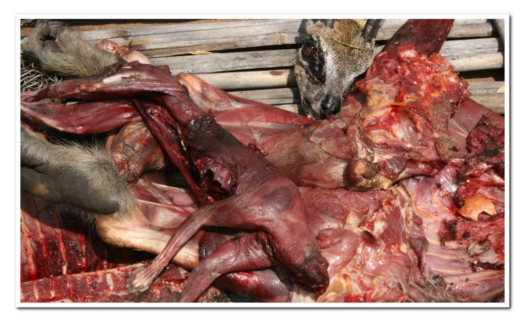
Above - various meats found with dog poachers - baboon, klipspringer, genet