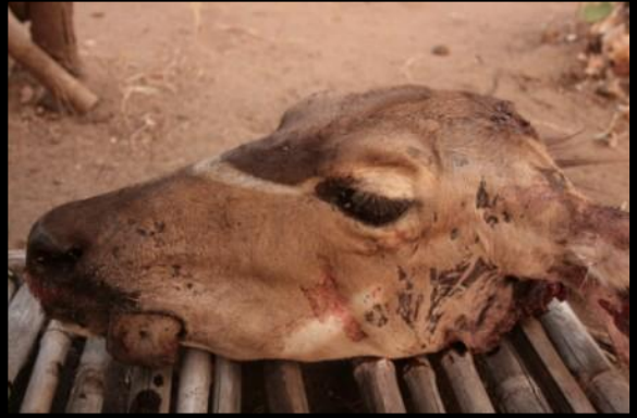
Above–Kudu killed for her meat by snare