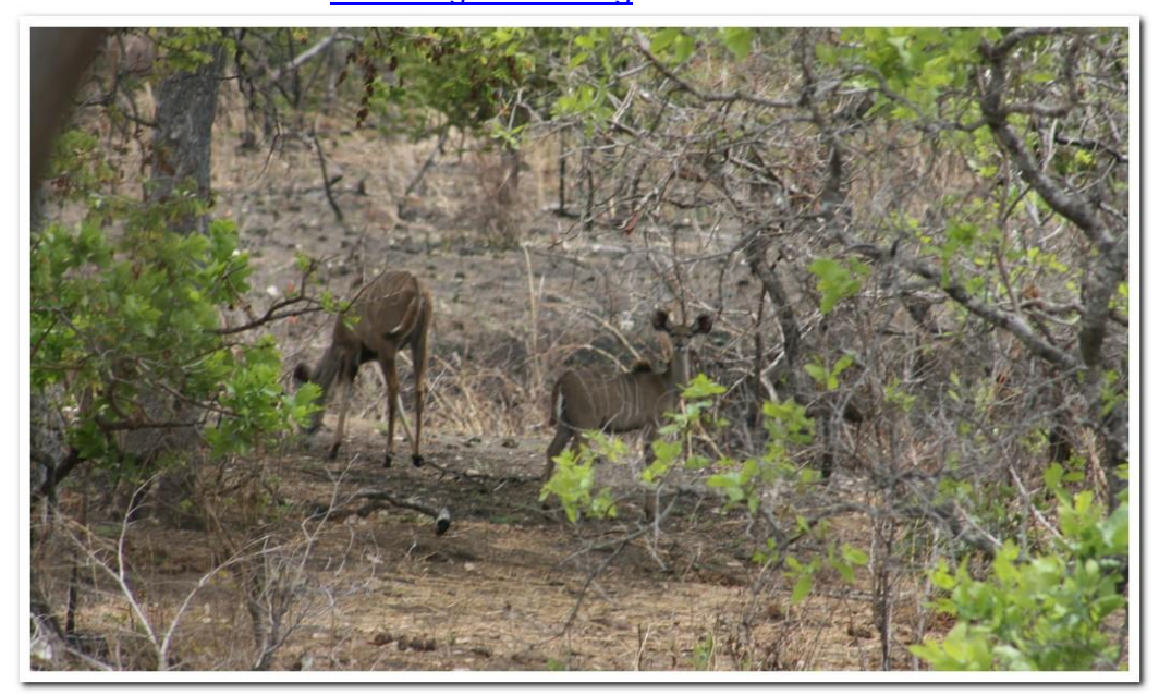
Kudu in Thuma - some of the animals that are hunted a lot with guns and snares

Check out our web site on www.wag-malawi.org.