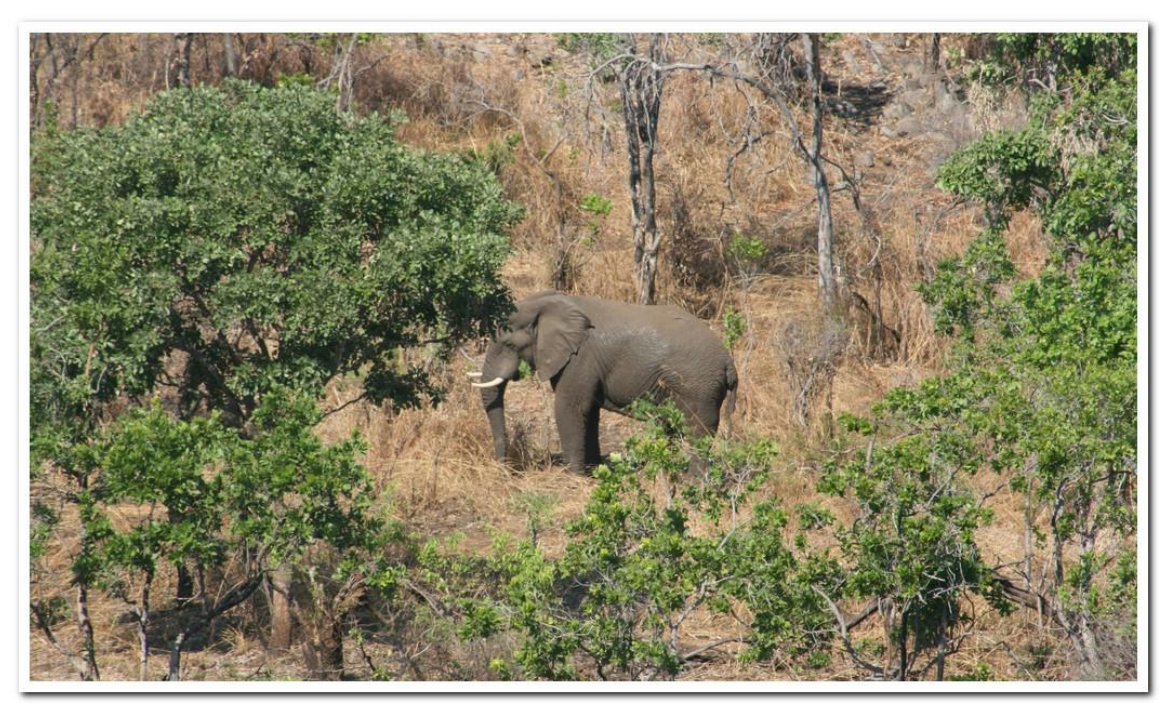
One on three bulls spotted one day