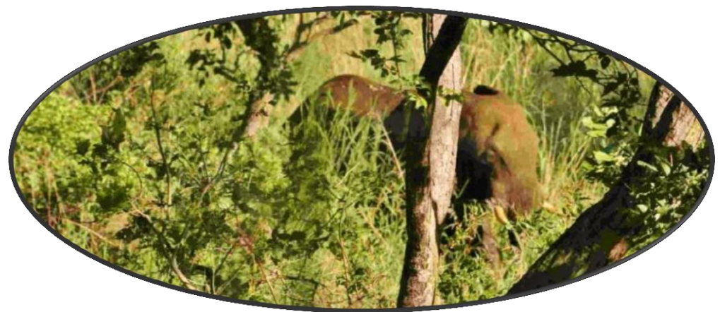
One of our male elephants moving through the long grasses