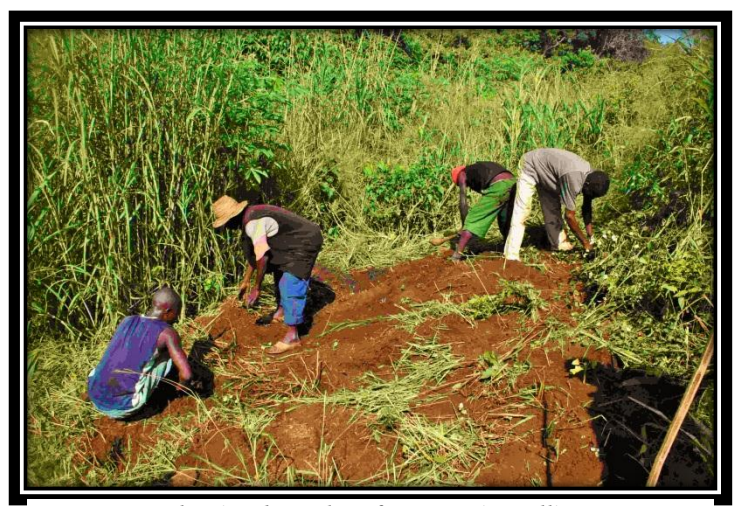
Planting boundary fence against ellies