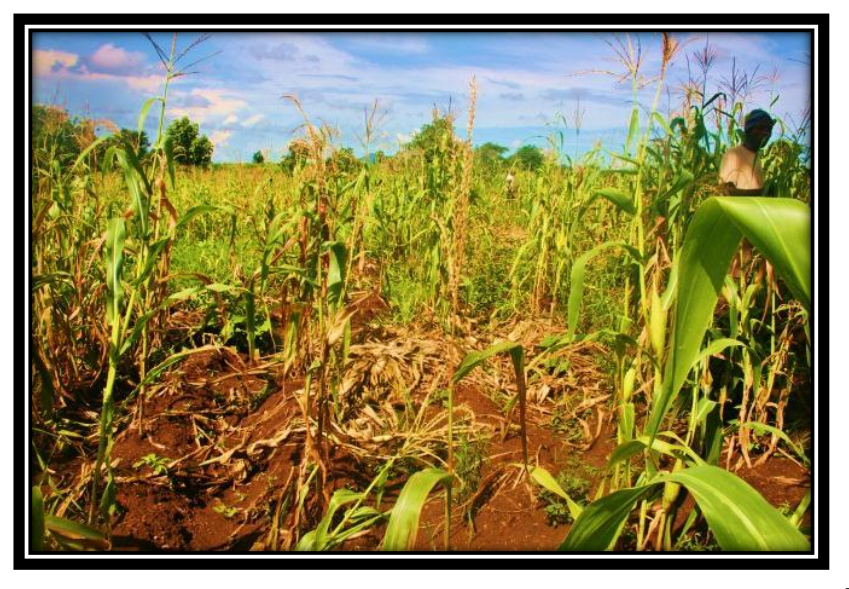
Maize field destroyed by elephants

As I am sure you all know Malawi is one of the world's poorest countries. Malawians staple diet is maize which most people eat daily and they grow it in their gardens. Farming is mostly subsistence farming meaning they grow food to feed their family. The Rains normally arrive around November and end around April. Last December the rains started, and everyone was busy in the field planting seeds and