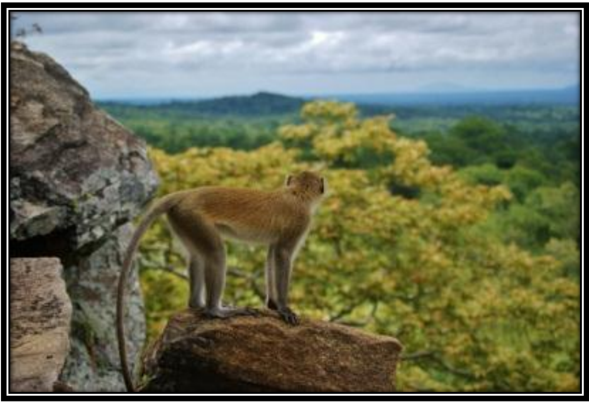
Piglet (our local friendly Vervet looking over his kingdom