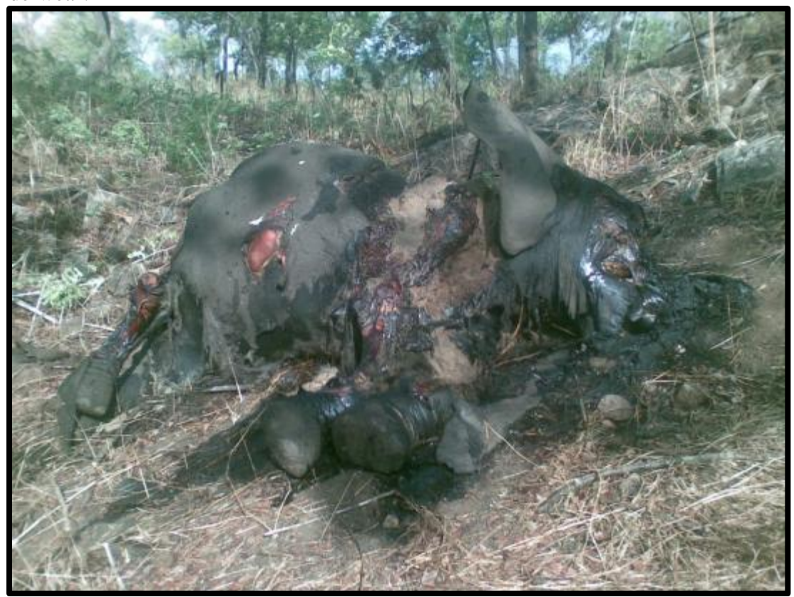
One of our poor elephants, butchered!

killed elephant. That night in a joint operation with Department of National Parks and Wildlife we raided the house and made two arrests. A homemade firearm was found and confiscated. We are waiting for the court case sentence to take place on the 16<sup>th</sup> of May. Two days later we managed to arrest two people trying to buy ivory, both were arrested and brought to the police but both were released without going to court! The lady wanting to buy the ivory had 43,000mk (less than 100 euro) to buy the ivory hidden in her underwear!