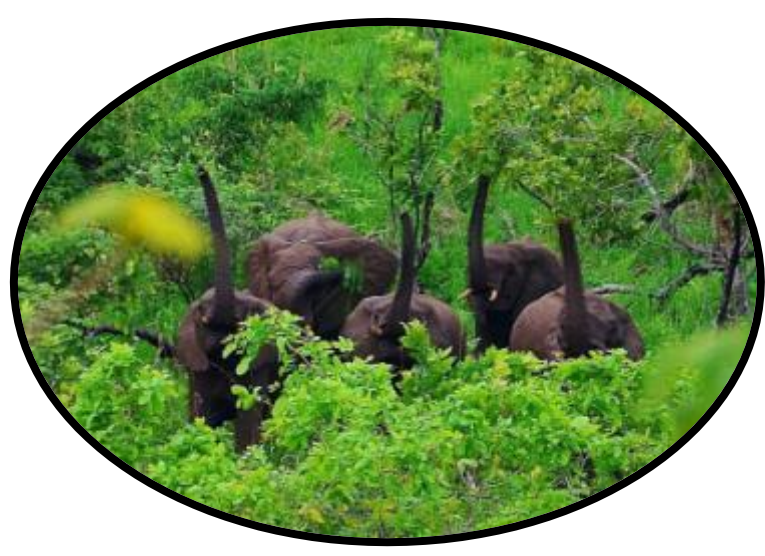
Catching the sent of us!