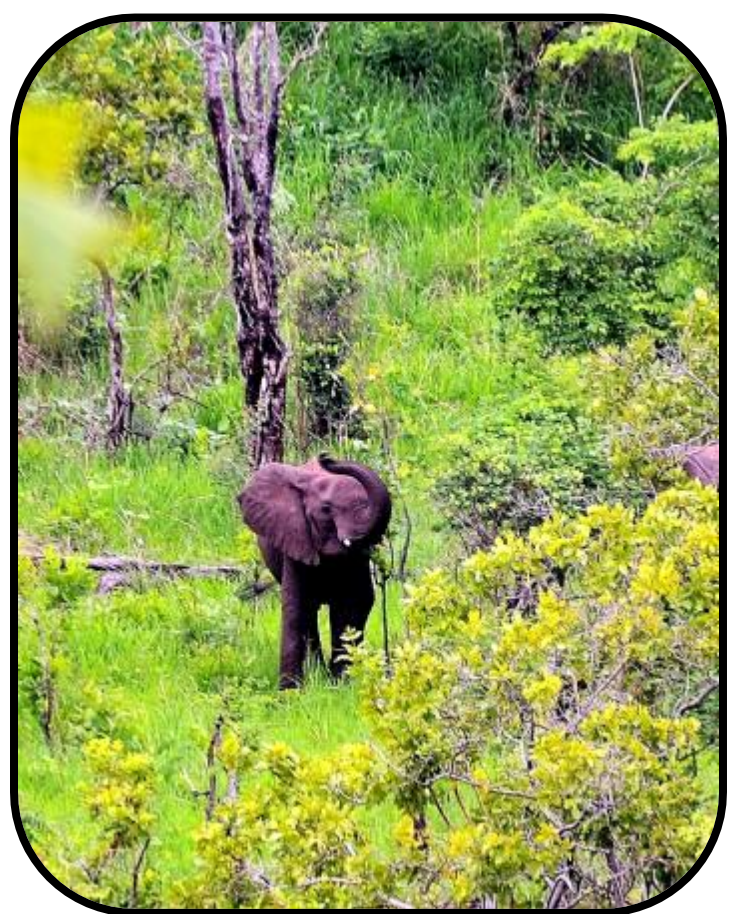
Vera reunited with her Family close to base camp!