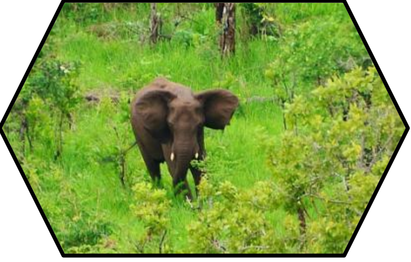
She is alive! Vera our injured ellie

In January 2013, one Sunday afternoon while sitting on top rock, we noticed a herd of elephants moving towards the camp. We watched 8 elephant with two babies and they came closer and closer. I got the binoculars