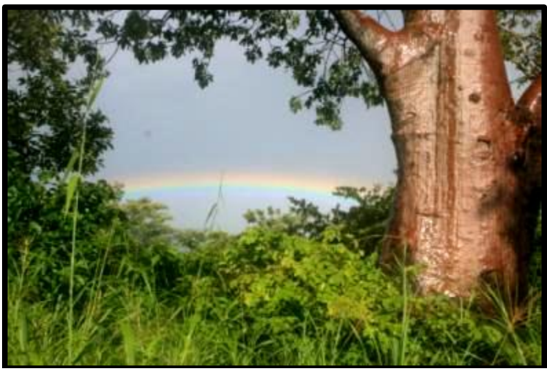
At the end of every rainbow there is a pot of gold! In this case it is Thuma!