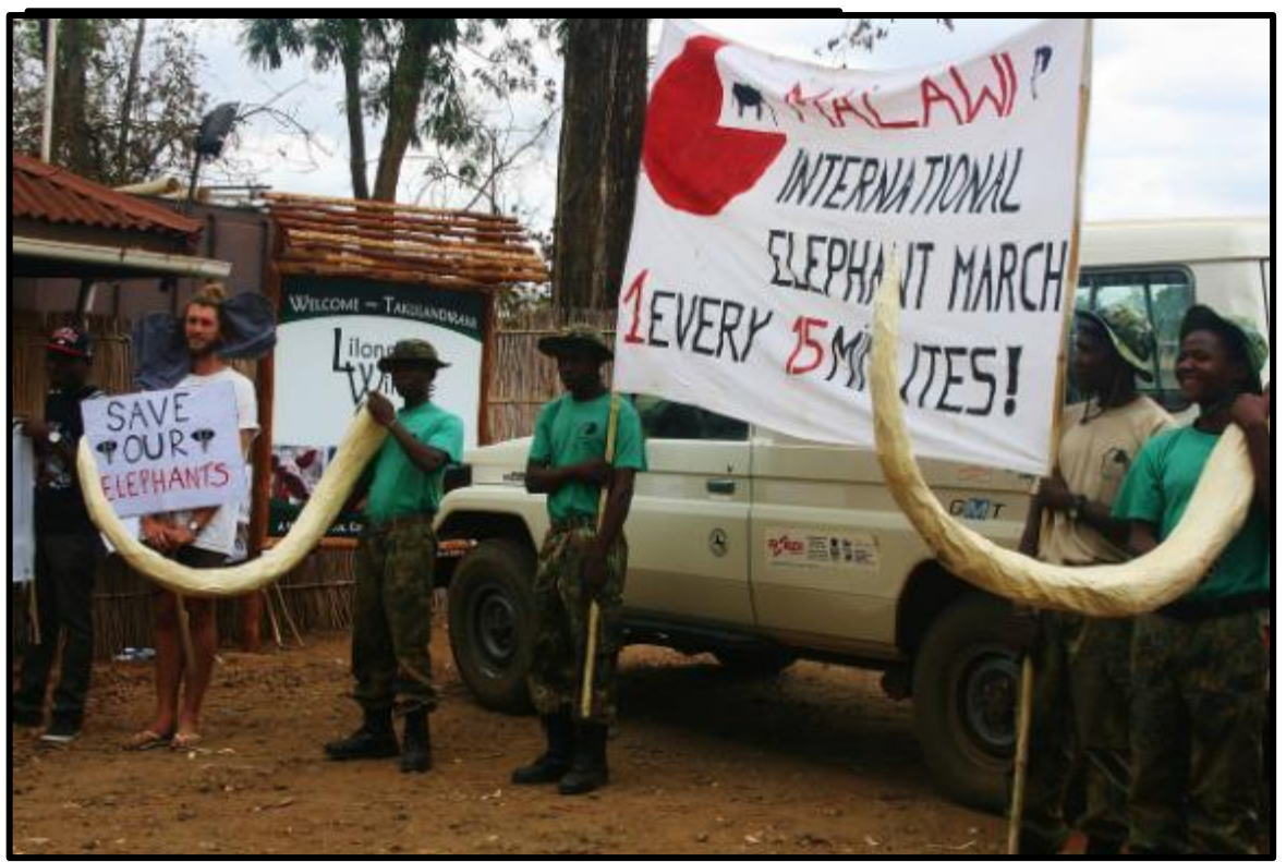
governments all around the world to impose harder sentences on those caught to try defer this illegal practice.

This march not only was to raise awareness of the current situation but also to lobby