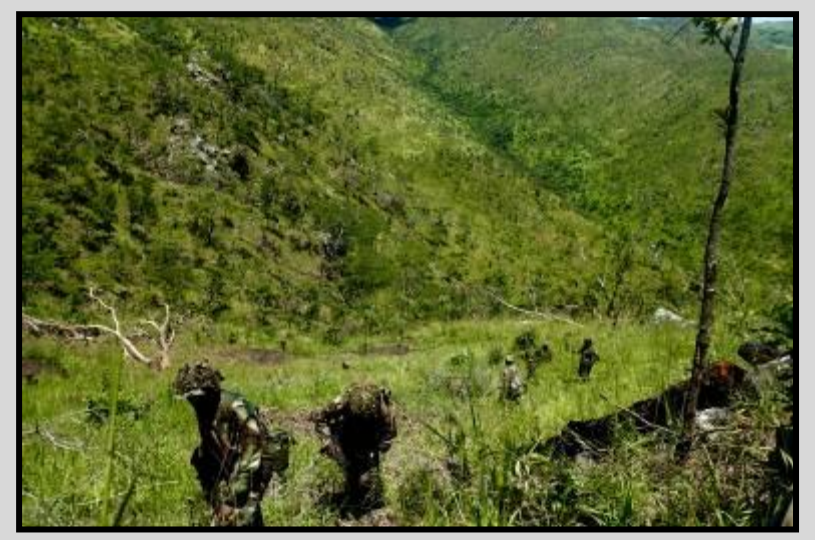
in 3 different patrols.

We were delighted they choose Thuma to carry out this task and they also allowed WAG scouts to take part in some of the training exercises.