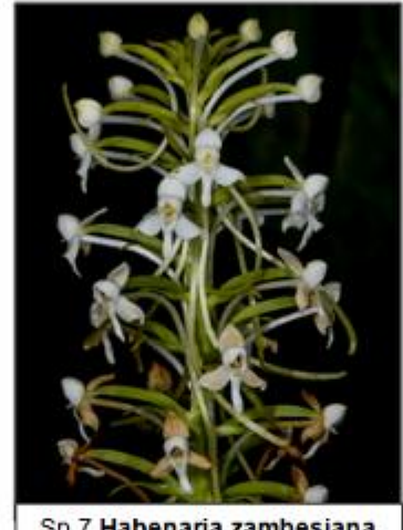
Sp.7 Habenaria zambesiana