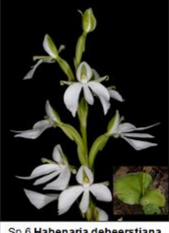
Sp.6 Habenaria debeerstiana