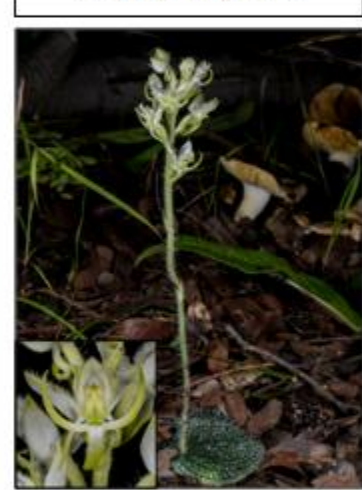
Sp.5 Habenaria leucotricha