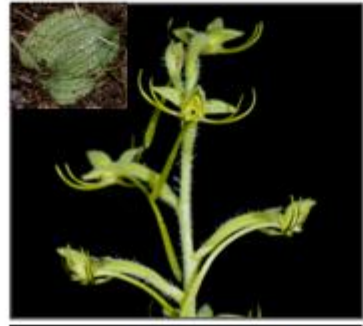
Sp.11 Habenaria pilosa