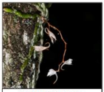
Sp.1 Microcoelia sp.