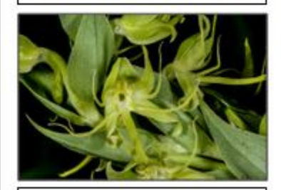
Sp.10 Habenaria sp.