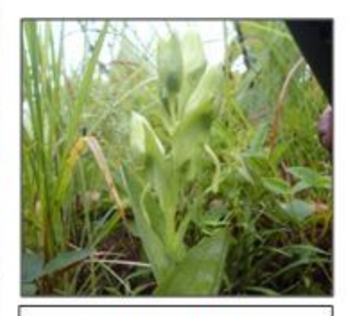
Sp.14 Habenaria sp.