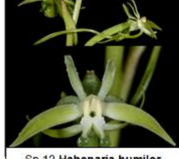
Sp.12 Habenaria humilor