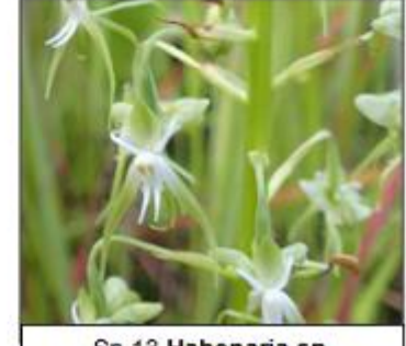
Sp.13 Habenaria sp.