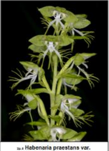
ses Habenaria praestans var.